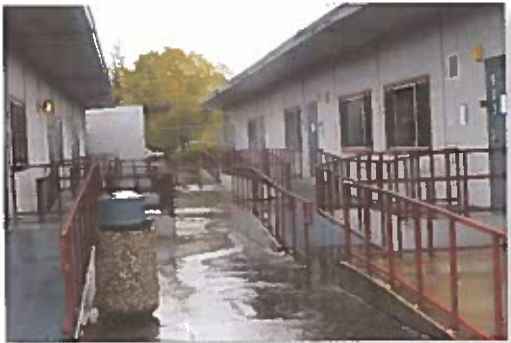
Overcrowding combined with aging classrooms has forced Woodcreek High School to use portable classrooms until a long-term solution is found.

Roseville High School, Oakmont High School, Granite Bay High School, Antelope High School and Woodcreek High School provide high-quality education that prepares students for college and 21st-century jobs.