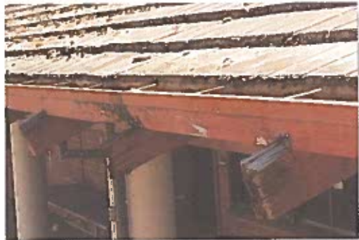
Some of our schools have leaky and deteriorating roofs like this section of dry rot at Roseville High School.